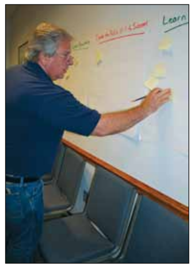
On board with learning, Page 18

Senate Bill 1, Unbridled Learning – whatever the title, board members need to know what's in store as the state enters a new era of education reform. KSBA has designed some tools to help, as the Graves County school board demonstrated ... Page 18