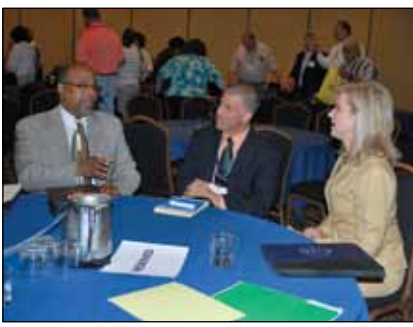
Summer leadership, Page 14

Kentucky School Advocate Volume 18, Number 1